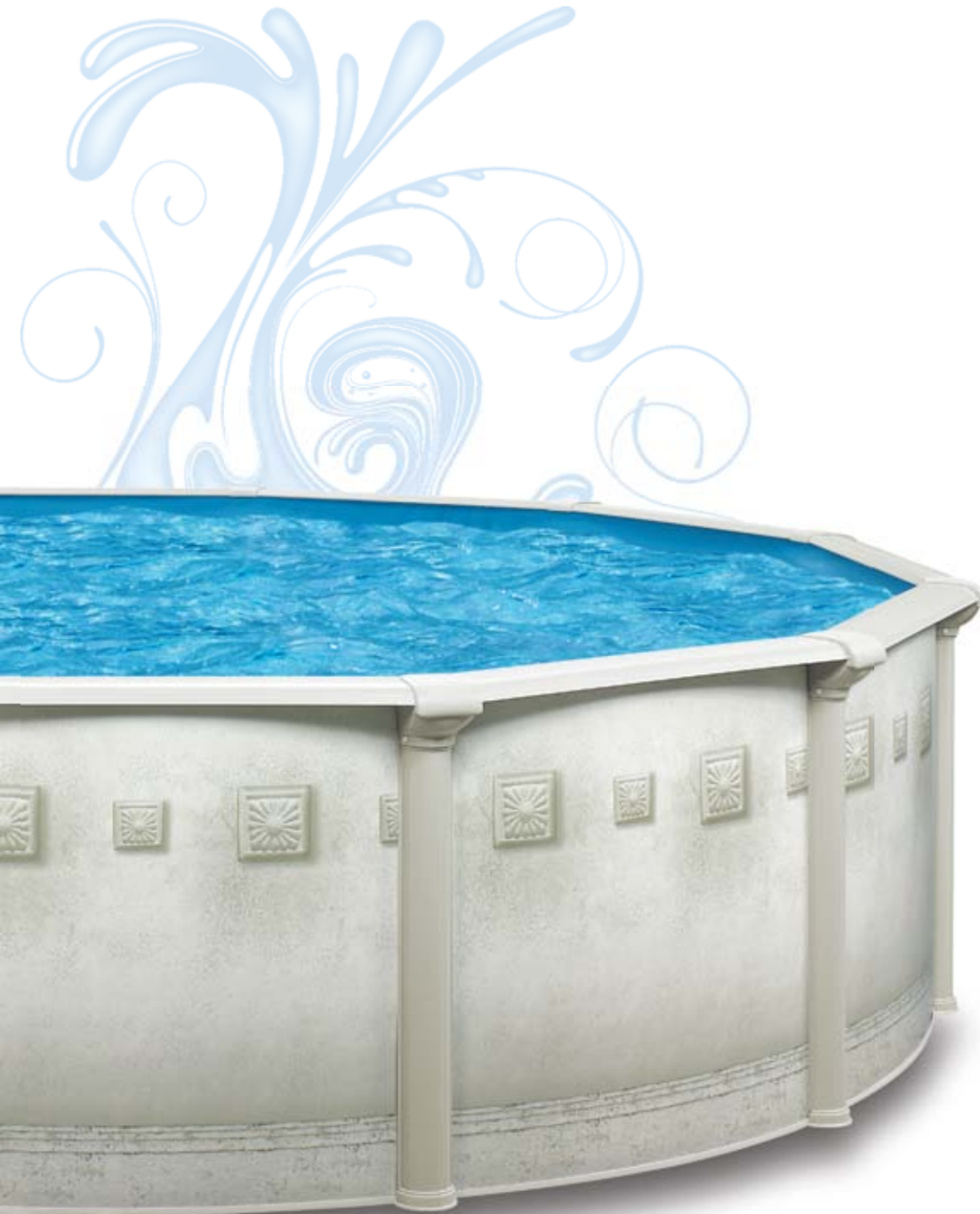
Round Kamika - Tuscan wall offered in 52 inches