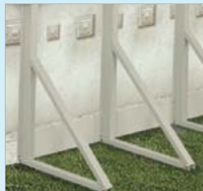
Heavy-duty angle brace system