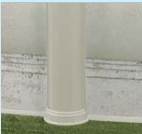
One-piece resin foot collar