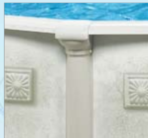
Ledge, cap and post designed for a secure fit